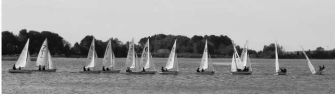
Varsity Regatta, October 25, 2009, St. Inigoes Creek

22 sailors from four high schools (Patuxent, Great Mills, Leonardtown, and Churchville Christian) practiced three days a week during the fall season at the Center. They help to host three regattas for schools in the Central League of the MidAtlantic Scholastic Sailing Association.